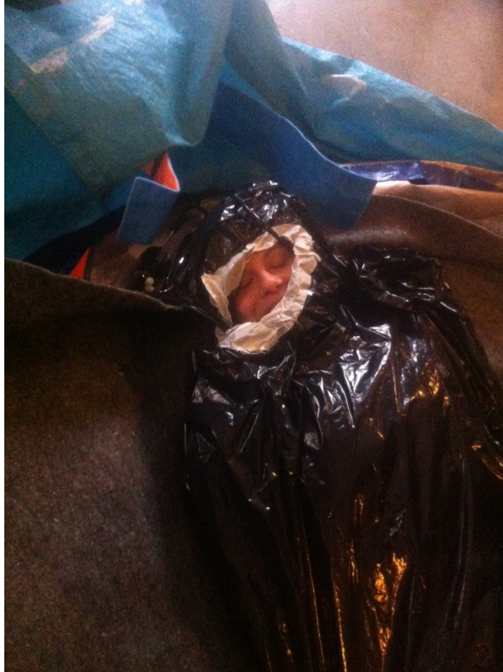
Step 6: practice our newly learned technique on Preston during our outdoor scenario