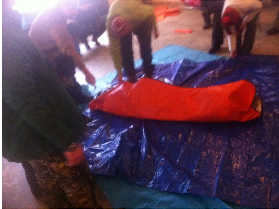
Step 3: Add eye protection